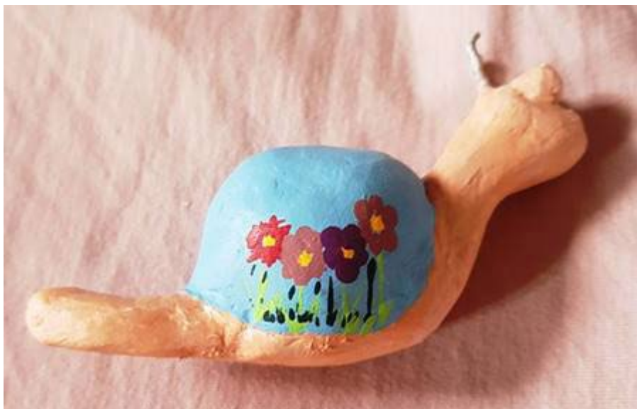
Saying it with flowers - new clay work from Philippa.

The staff team had a business plan review meeting on Wednesday. It's not easy to think too far ahead but it was a very positive meeting. Your views and opinions are important to the plan and we'll arrange to meet on Zoom in the coming weeks, probably a Monday. Please let us know if you are interested in joining.