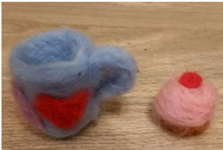
I've been doing some felting recently so have sent the attached to show you what I have done. See you soon. Moira Amazing felting Moira!

All the images can be found on the Art Matters Instagram account.