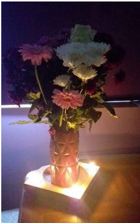
The light fantastic. Ian's new candle holders.