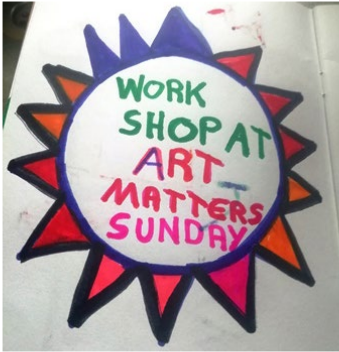
Your support is always appreciated Barry – great new work!